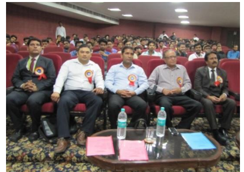
Participants at National Student Convention