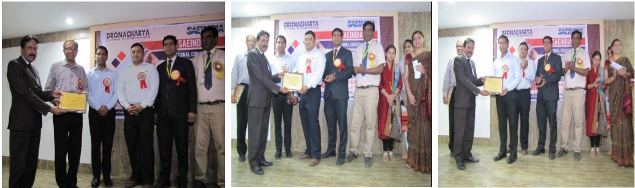
Memento presented to the Chief Guest and Experts