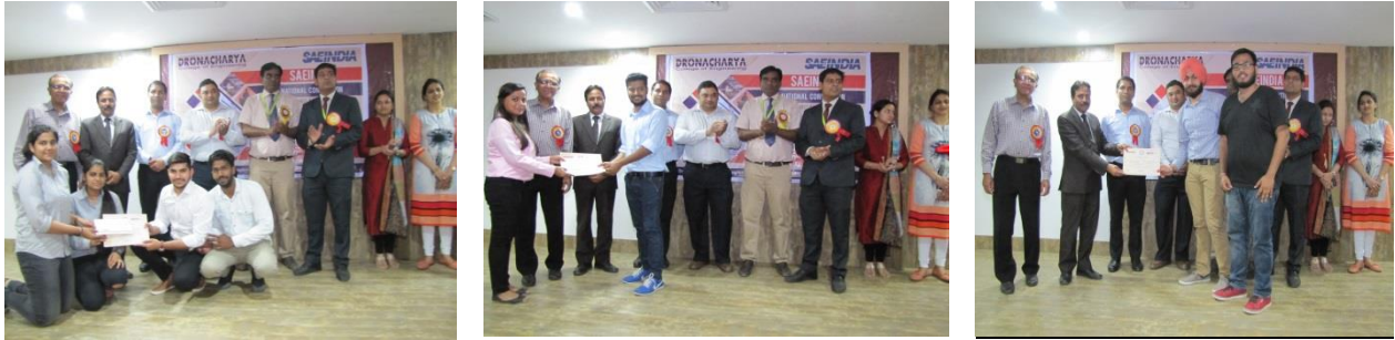
Certificates and Award distribution to the winners