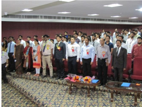
Participants and Dignitaries standing for National Anthem