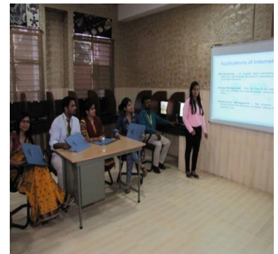
Paper Presentation by students