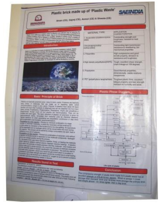
Poster Presentation by students

More than 60 papers were received out of which 28 papers were selected for presentation in the convention. The papers included important topics such as IOTs, smart building, automations, Android applications, etc. from different branches.