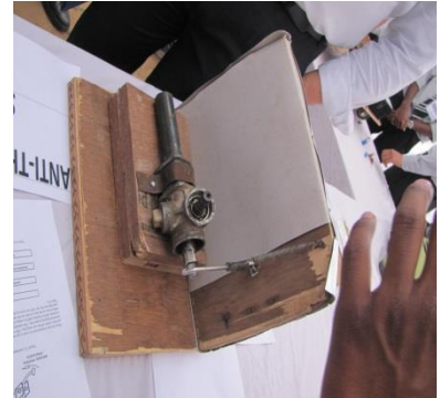
Project Exhibition by the students

Posters were prepared by the students from almost all branches in the field of construction, power generation, materials, automobile engineering. The presenters were appreciated by the judges.