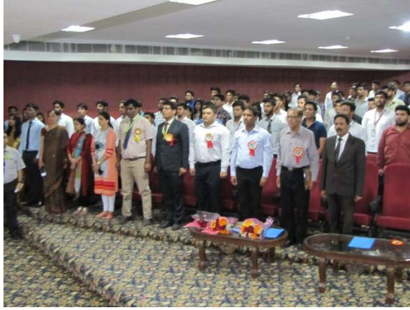
Participants and Dignitaries standing for National Anthem