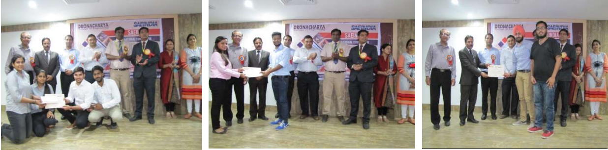
Certificates and Award distribution to the winners