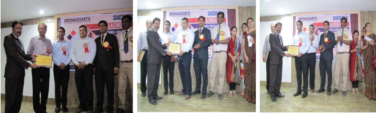
Memento presented to the Chief Guest and Experts