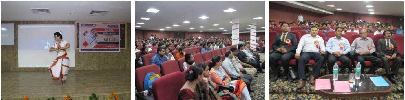
Participants at National Student Convention