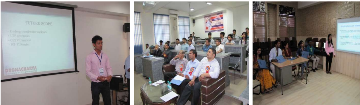
Paper Presentation by students

More than 60 papers were received out of which 28 papers were selected for presentation in the convention. The papers included important topics such as IOTs, smart building, automations, Android applications, etc. from different branches.